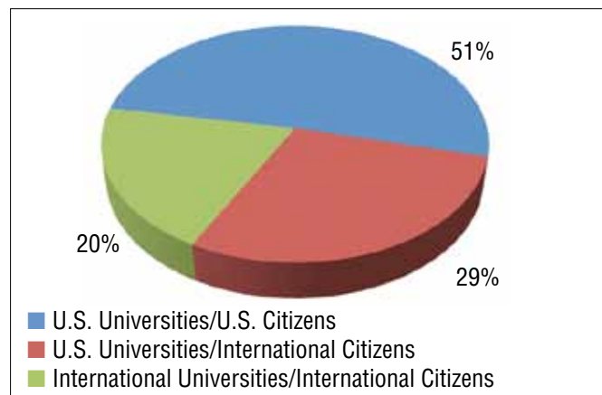
Figure 2. SEG Foundation scholarships are increasingly global in their impact.