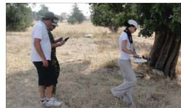
(left) "A geo-archaeological survey using EM methods in Cyprus, summer 2010"